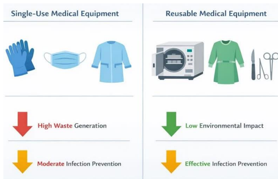
Figure 1. Comparison of single-use and reusable equipment in infection control and environmental consequences.

in resource-limited settings, the high cost of disposables lead to dangerous unauthorized reuse, a critical safety gap that integrated environmental health strategies fail to address adequately in many existing frameworks.