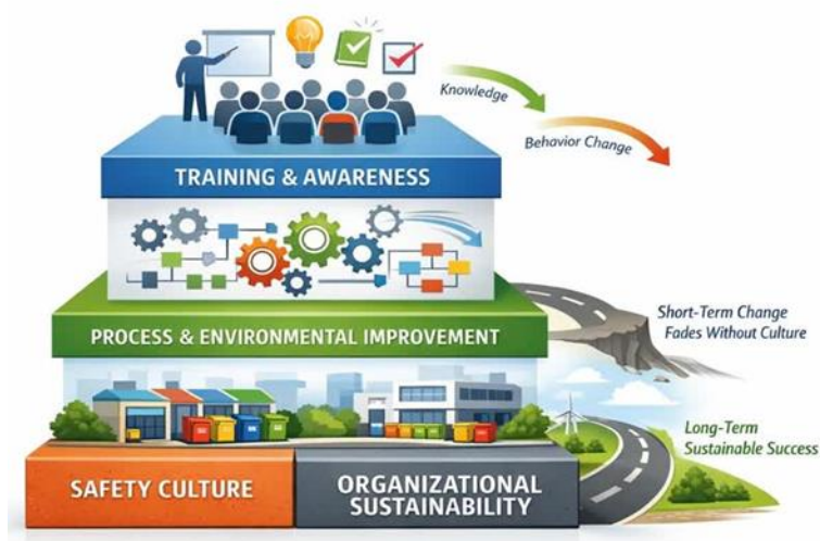
Figure 3. Conceptual model of the role of safety education and safety culture in sustaining correct waste management behaviors.

simultaneously (39,40). Furthermore, the lack of comparative studies between integrated approaches and fragmented approaches represents a serious limitation for policy and implementation recommendations (41,42). These weaknesses provide a clear research pathway for future investigations and the development of system-oriented frameworks.